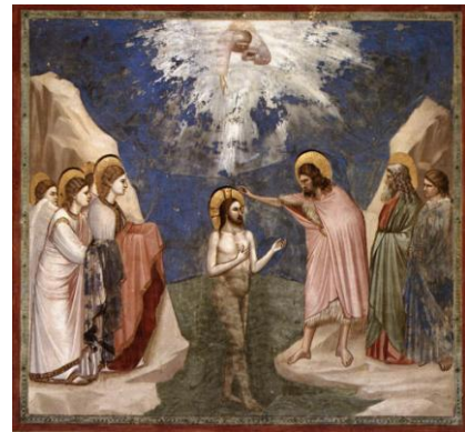
Giotto – Baptism of Jesus

In the Old Testament the idea of covenant is of whole nations recognising that they have gone astray, promising to love God and renewing their efforts to 'do the right thing'.