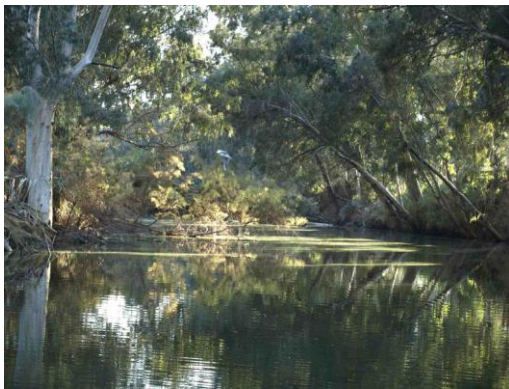
The River Jordan

Baptism mirrors this: it is a sacrament of initiation or new beginning, which involves making solemn declarations and promises, accompanied by signs and symbols to represent their meaning.